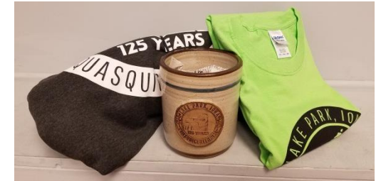
125 th Memorabilia Available at City Hall